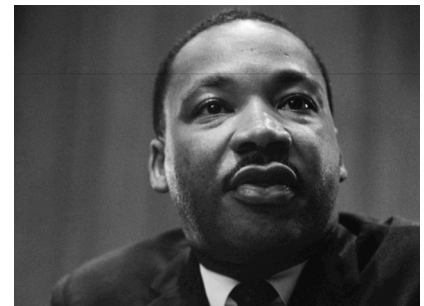
Rev. Martin Luther King, Jr. 1929-1968

"Rarely do we find men who willingly engage in hard, solid thinking. There is an almost universal quest for easy answers and half-baked solutions. Nothing pains some people more than having to think."