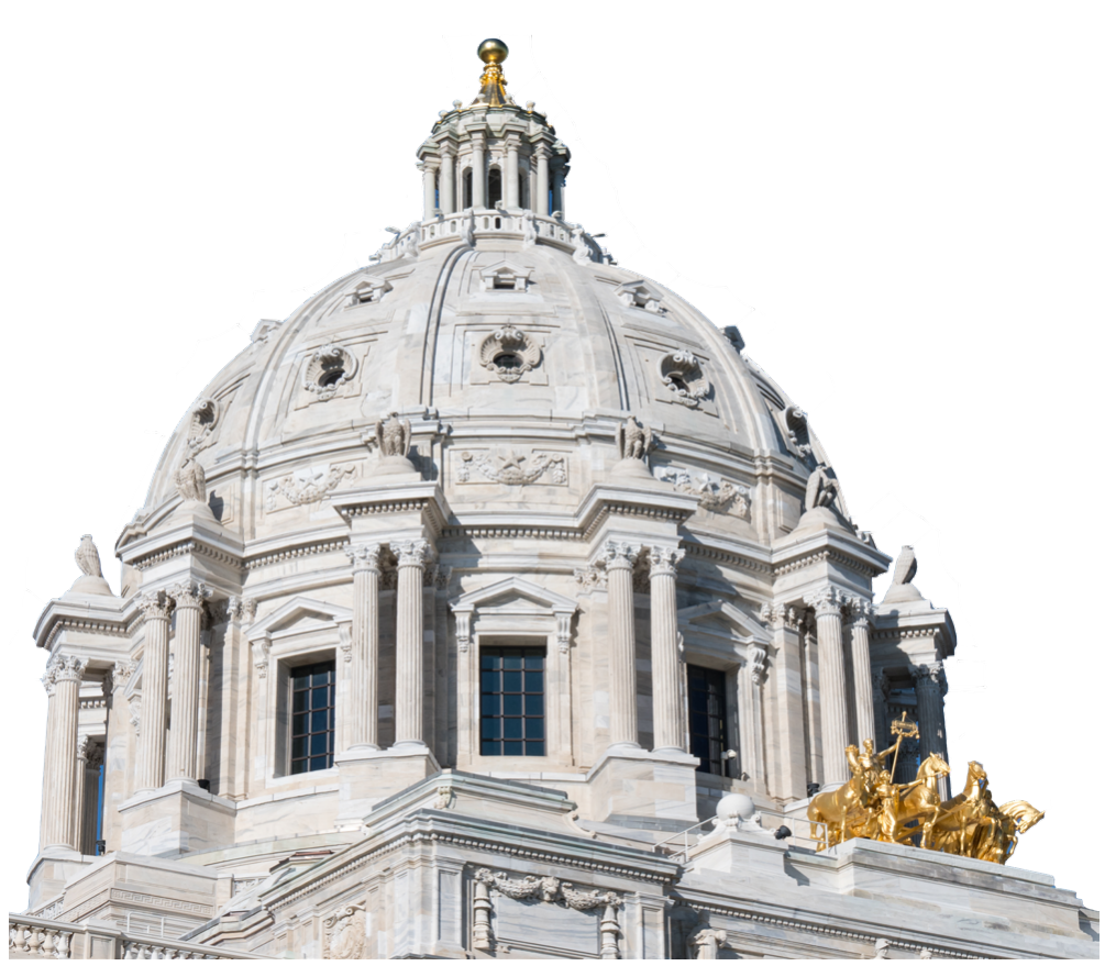
Government Relations Update

Keep an eye out in the Education Minnesota all member emails, which keep us up-to-date on upcoming statewide virtual lobby days. This is a great way to learn a little at a time and talk directly with legislators from the luxurious comfort of your own living room. The next Lobby Day takes place on Tuesday, Feb. 9, from 4:30-5:30 p.m. The subject will be fighting for education equity, with a special emphasis on recruiting and retaining educators of color. We will discuss the 2021 Increase Teachers of Color Act, along with racial equity aid, full-service community schools and trauma-informed professional development funding.