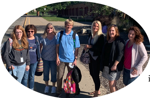
Hats off, Roosevelt Middle School Staff!

Roosevelt Middle School and McKinley Elementary are awarded the National Blue Ribbon School Distinction.