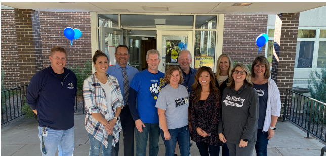
Kudos to the McKinley staff responsible for the application.

The Minnesota Blue Ribbon Schools are Barnesville Elementary School in Barnesville, Roosevelt Middle School in Blaine, Twin Lakes Elementary in Elk River, Minnetonka West Middle School in Excelsior,