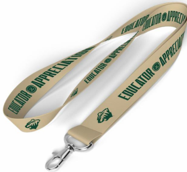
Actual item may vary from picture

Teachers deserve an A+ too! Join us for Educator Appreciation Night on Thursday, October 19 when the Wild take on the LA Kings. Ticket pack offer includes a Minnesota Wild branded educator lanyard. Additionally, a portion of each ticket purchased donated back to the Education community.