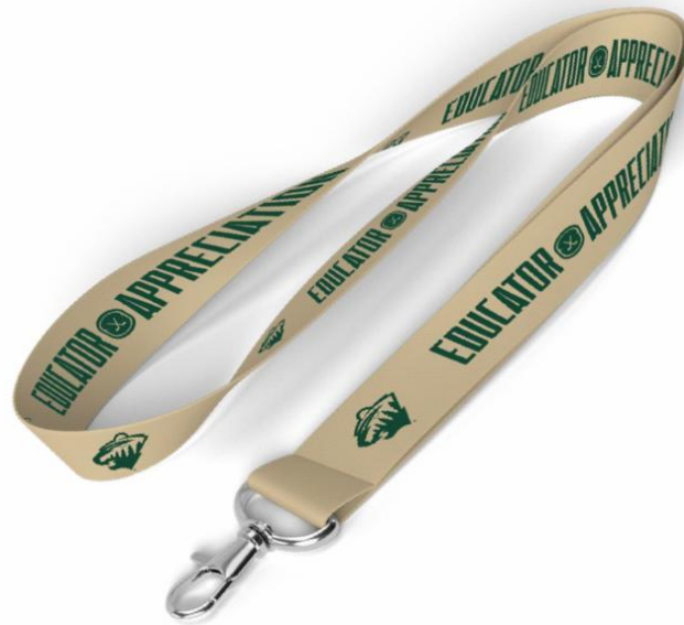
Actual item may vary from picture

Teachers deserve an A+ too! Join us for Educator Appreciation Night on Thursday, October 19 when the Wild take on the LA Kings. Ticket pack offer includes a Minnesota Wild branded educator lanyard. Additionally, a portion of each ticket purchased donated back to the Education community.